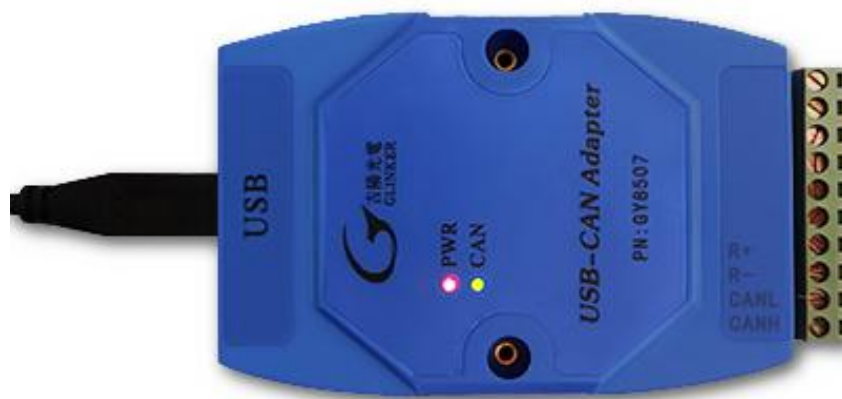
Picture 1 appearance of GY8507